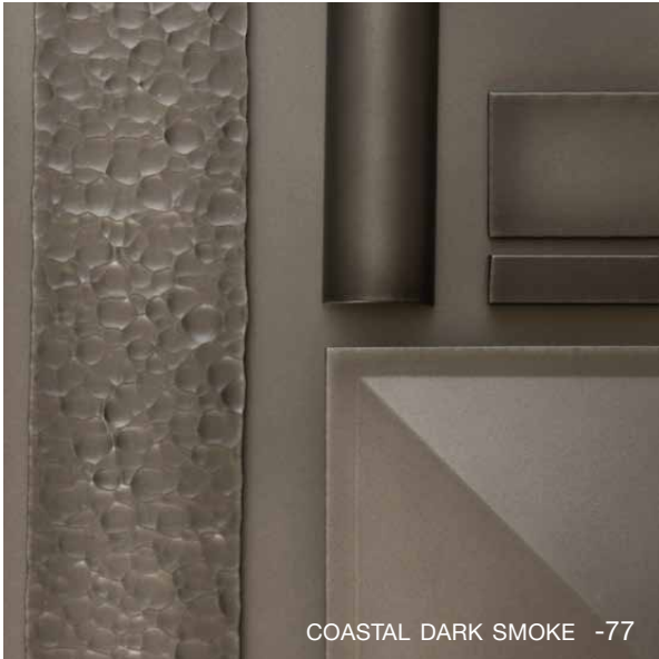
COASTAL DARK SMOKE -77