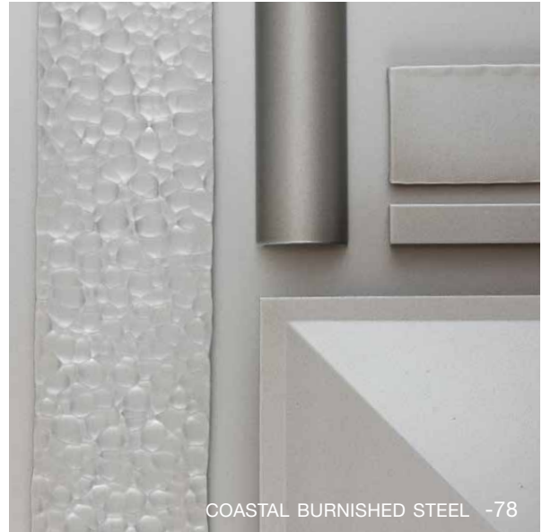
COASTAL BURNISHED STEEL -78