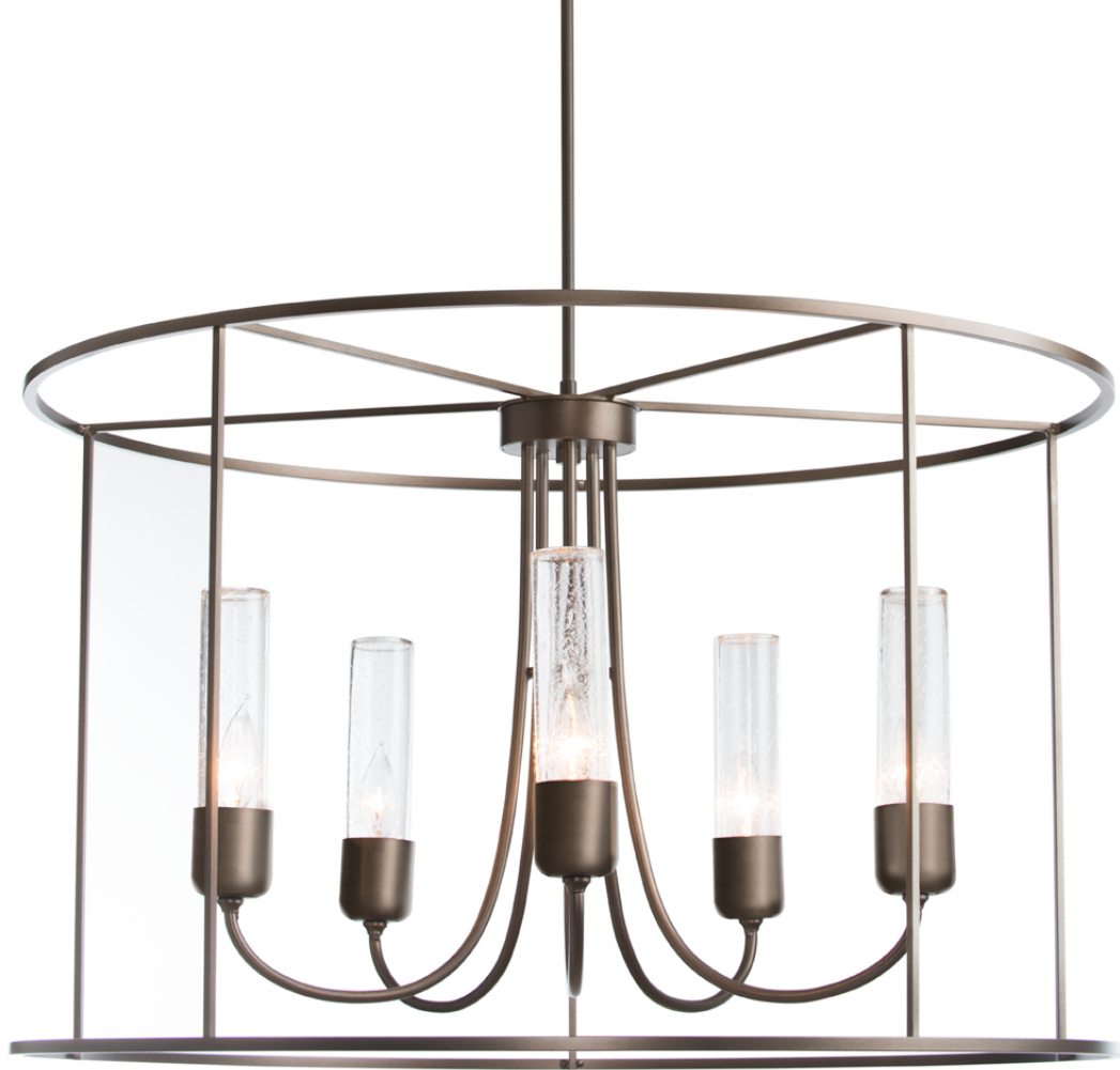
PORTICO DRUM = 362010 · ALUMINUM 32" dia = dimmable = UL outdoor damp Candelabra (5), 60W max, not included