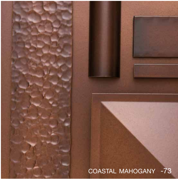
COASTAL MAHOGANY -73