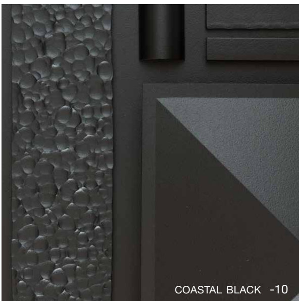
COASTAL BLACK -10