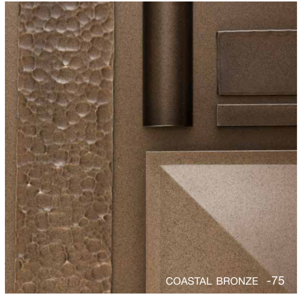
COASTAL BRONZE -75