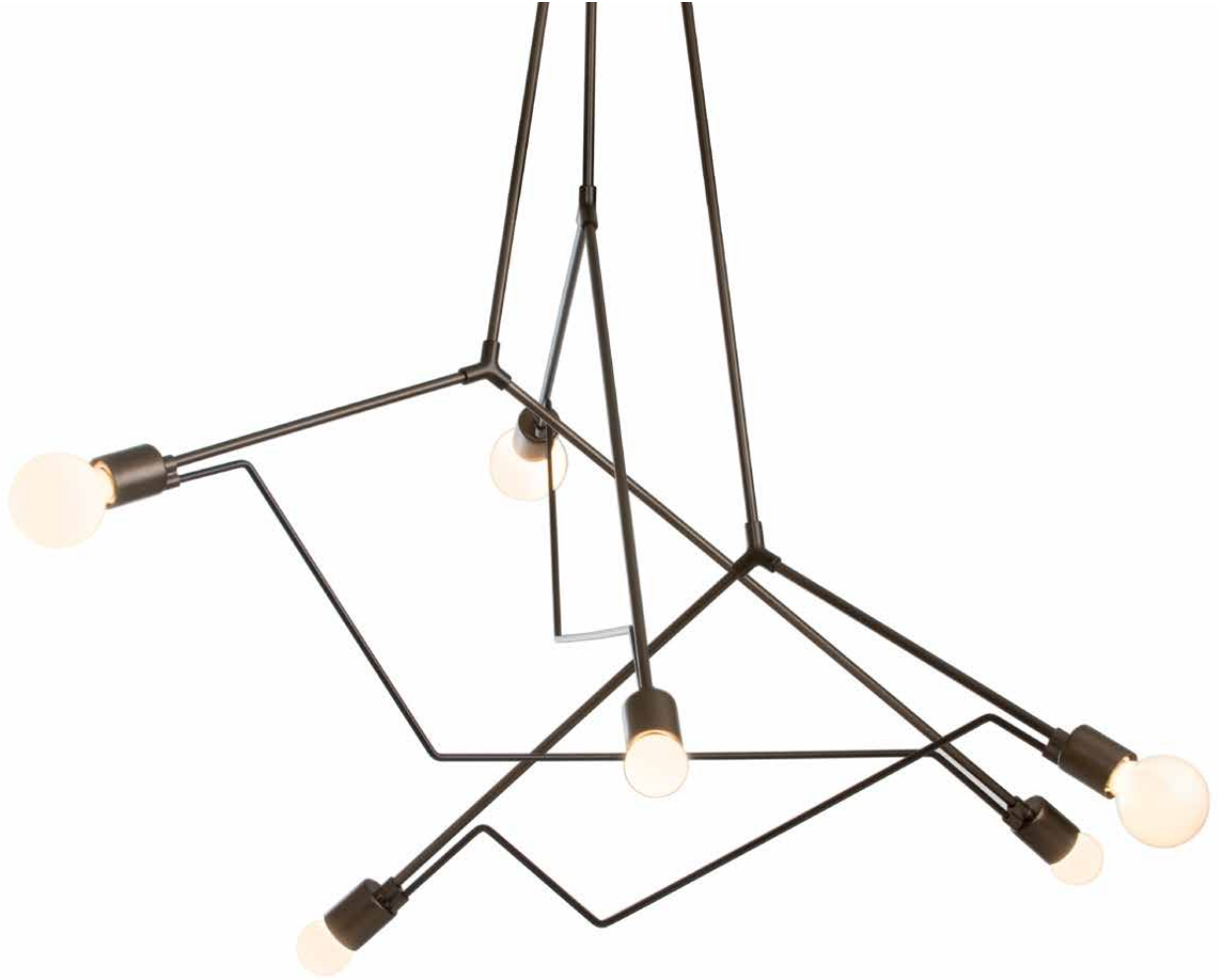
DIVERGENCE = 362015 · ALUMINUM 54.2" dia = dimmable = UL outdoor damp A19 bulb (6), 60W max, not included